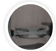
Adjustable lumbar support