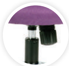
Synchronised tilt mechanism