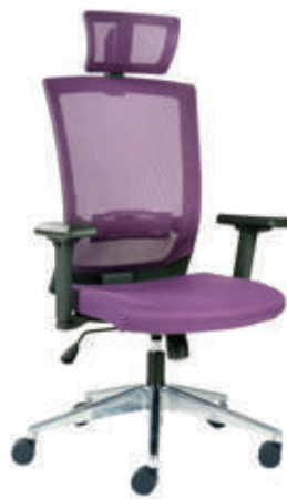
Polished aluminium base