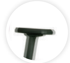
1D/3D arm adjustment