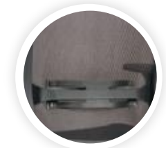
Adjustable lumbar support