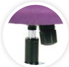
Synchronised tilt mechanism