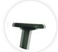
1D/3D arm adjustment