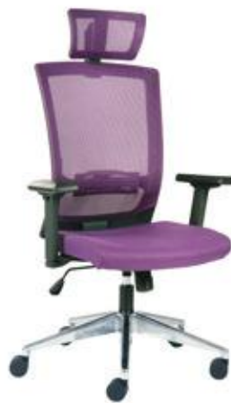
Polished aluminium base